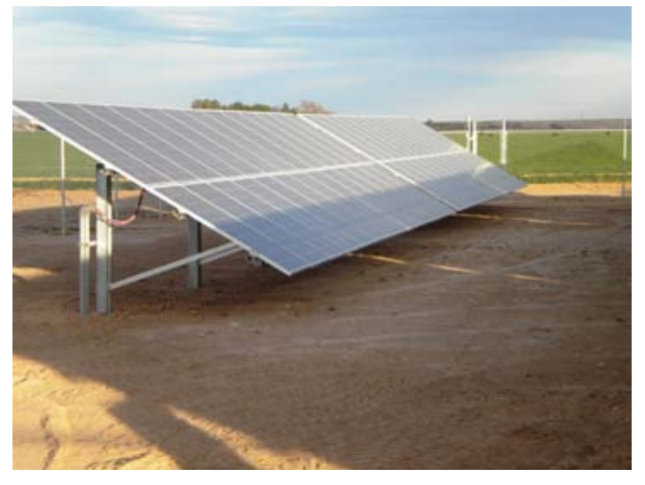
Fig. 4: Inter-row shading in an array can lose production in a complete string with standard modules while still exposed to sunlight

This advantage is best seen in installations where inter-row shading can cause the system to stop generation (fig. 4). By splitting the REC TwinPeak into two sections, the string will continue to produce electricity in at least 50% of the panel until the other section is also shaded (fig. 3b) improving the overall energy yield.