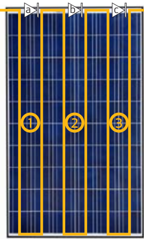
Fig. 1: Standard and REC TwinPeak modules showing representative flow of current through cell strings (1, 2, 3, 4, 5, 6) and bypass diodes (a, b, c)

One of the most striking features of the REC TwinPeak Series is its use of smaller cells. These are in fact, regular 156 mm (6 in) cells cut in half. The smaller size reduces internal resistance, increasing output, and has allowed REC to take a new approach with the layout, removing one cross connector, which enables greater inter-cell spacing and an increase in captured light. The removal of the cross connector is aided by a threepart junction box, placed in the middle of the rear of the module. The effect of this is to split the cell strings into two, i.e., six strings in total, controlled by three bypass diodes as shown below (fig.1). With this, the module takes on a different behavior pattern in shaded conditions which can help achieve an increase in overall energy yield.