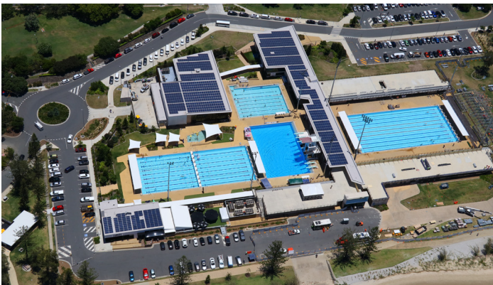
Img. 1: Once installed, the energy generated by an installed solar PV system will quickly reproduced the energy used in its manufacture, dependent on a number of factors.

One of the main advantages of photovoltaic solar cells is the ecological clarity of direct conversion of solar energy to electricity. Often overlooked however, is the energy used to manufacture the generation system in the first place. Indeed, the benefits of using renewable energy would be rendered completely ineffective if the energy used in the making of a solar module for example was more than it produces in its lifetime, leading to an overall energy debt – but this is clearly not the case.