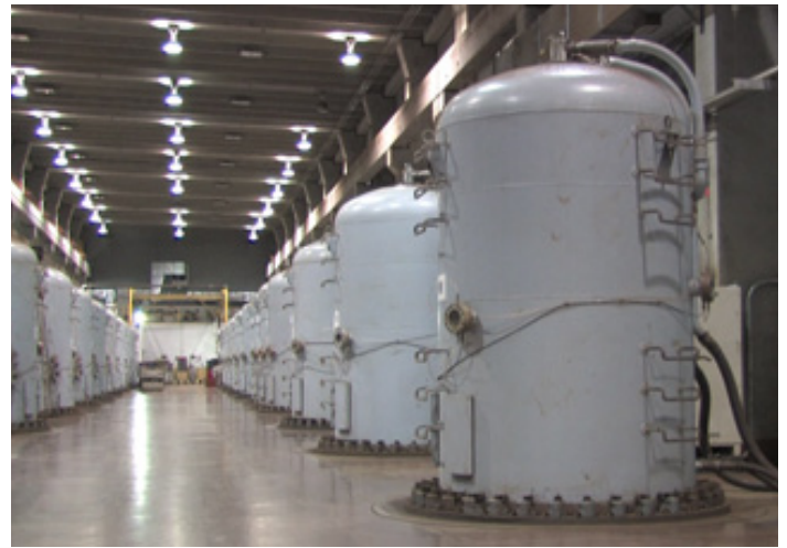
Img. 2: Industrial scale production of silicon in Siemens reactors.

heating processes used by the carbothermic reduction of silicon dioxide in electric furnaces to purify the silicon. In fact, in the most commonly used purification process – a Siemens reactor – the silicon is heated to over 1500°C in an oven over a period of time using more than 200 kWh/kg. As silicon produced in this way is produced in batches, it is clear that the heating of the reactor to the required temperature uses incredible amounts of energy; keeping it at the required temperature, and the subsequent cooling, are also hugely energy intensive processes.