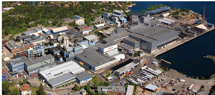
Img. 3: REC Solar Norway's production facility in Kristiansand, Norway

With the 2015 combination of the REC Solar Norway silicon and the REC solar module production chains into one company, REC is able to present a fully integrated solar value chain that begins with the extraction of quartz from its own mines and ends in producing clean energy generating solar modules; all done with complete quality control over all processes and the lowest primary energy usage in the industry.