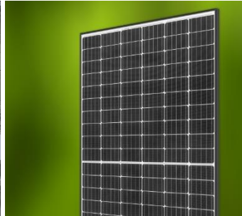
REC TwinPeak 2 Mono – one of REC Group's recent product innovations, based on REC's award-winning TwinPeak technology with half-cut cells and REC's twin-panel design