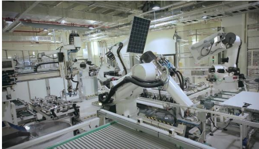
REC Group's fully automated and vertically integrated manufacturing site in Singapore