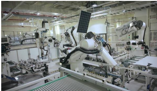
REC Group's fully automated and vertically integrated manufacturing site in Singapore