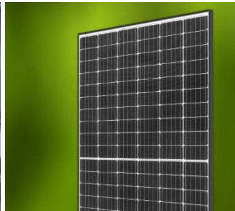
REC TwinPeak 2 Mono – one of REC Group's recent product innovations, based on REC's award-winning TwinPeak technology with half-cut cells and REC's twin-panel design