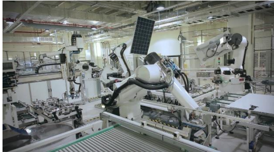
REC Group's fully automated and vertically integrated manufacturing site in Singapore