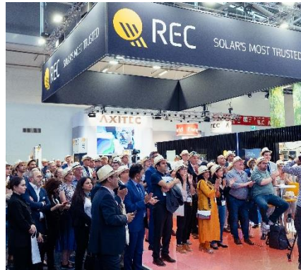
REC at Intersolar Europe 2022