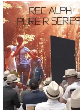
Launch of REC's latest innovation: REC Alpha Pure-R