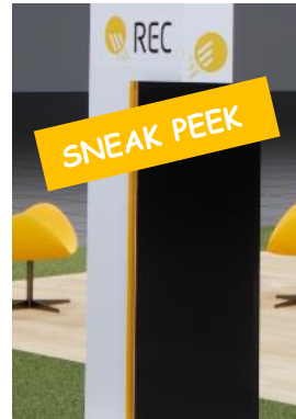
Sneak peek of REC's upcoming product at this year's Intersolar Europe